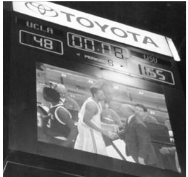
The scoreboard tells the story as WSU makes history in Los Angeles.

WSU completed its first sweep of UCLA and USC in Los Angeles and just the 11th weekend road sweep since the Pac-